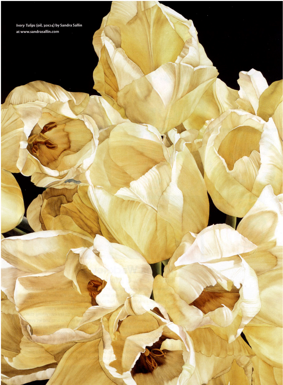
Ivory Tulips (oil, 30x24) by Sandra Sallin at www.sandrasallin.com